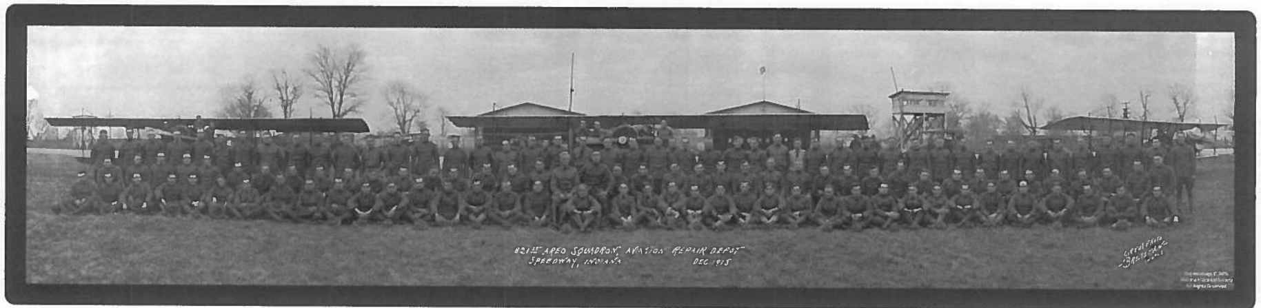
Photo is taken in the Indianapolis Motor Speedway infield