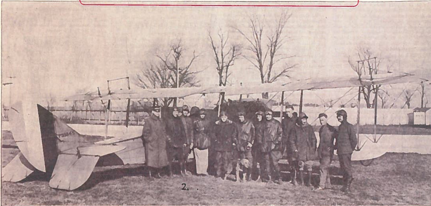
A GROUP OF THE AVIATION REPAIR DEPOT OFFICERS AT THE FLYING FIELD, SPEEDWAY MOTOR TRACK.