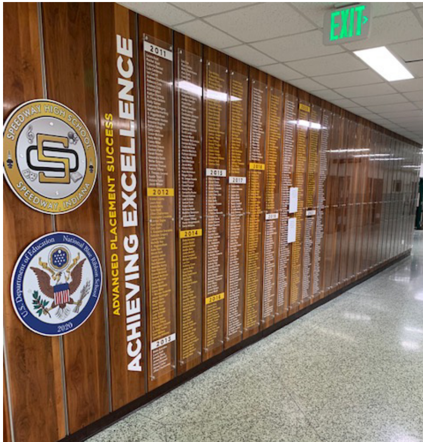
A WALL OF EXCELLENCE. Speedway High School recently unveiled a new wall display honoring students earning qualifying scores on AP tests. The wall recognizes students from 2011 - 2021 and will be updated each summer.